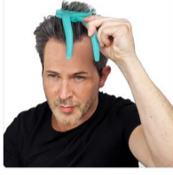
2 Choose Length