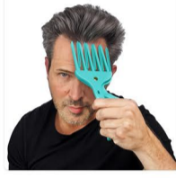
1 Select Hair